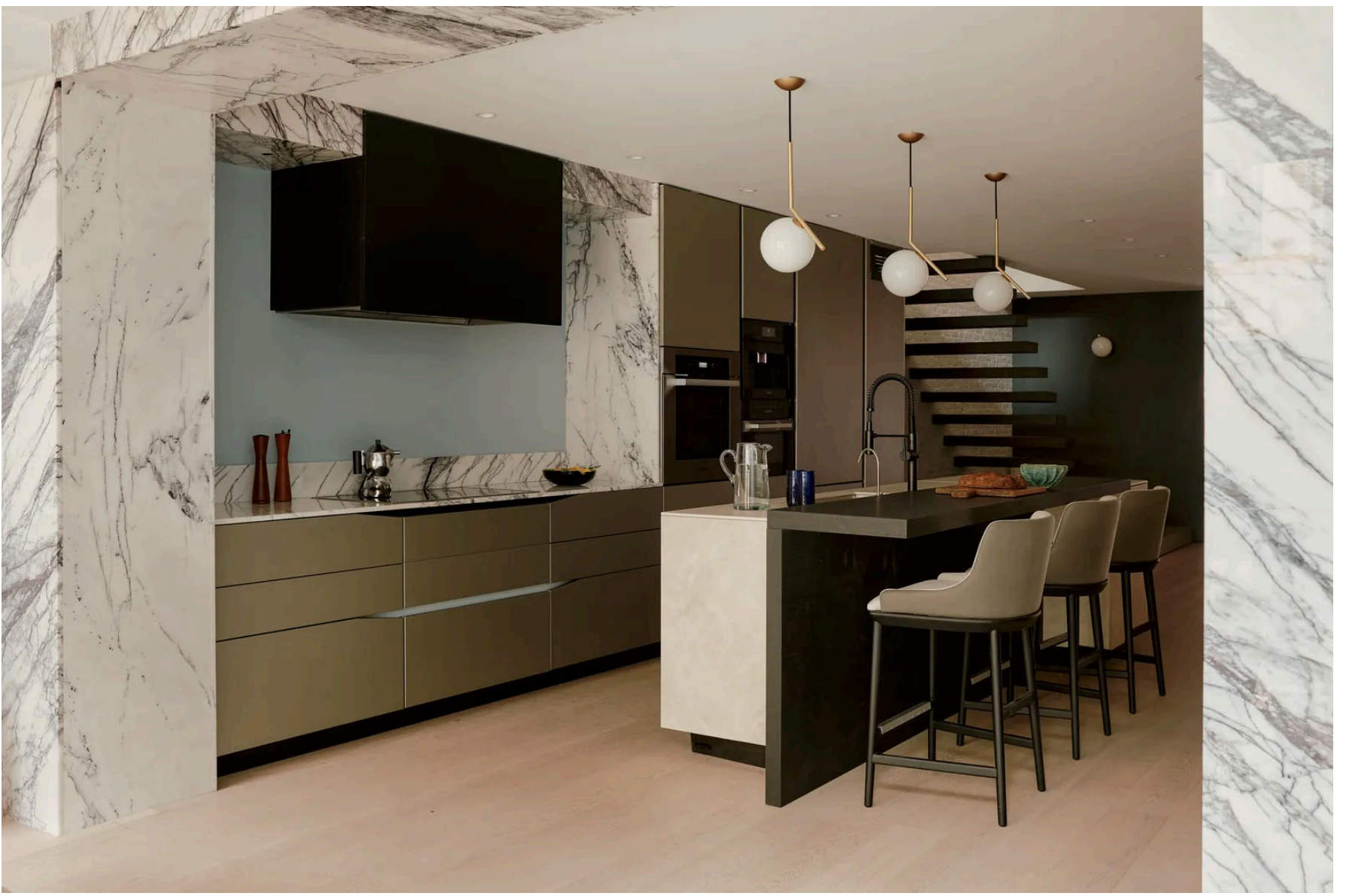
The kitchen by Snaidero features Miele appliances , Lilac marble countertops and backsplash, olive-green cabinet fronts, and lighting by Flos .