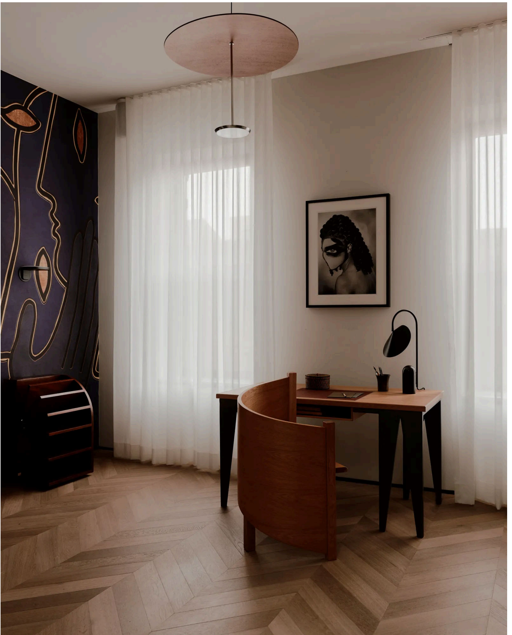
The office is decorated with a desk by Hugo Besnier , chair by Cultivation Objects , pendant by Pablo Designs , and a vintage Gregori Warchavchik magazine rack. The mural-like wallpaper is by Affreschi & Affreschi , made with a custom blue.