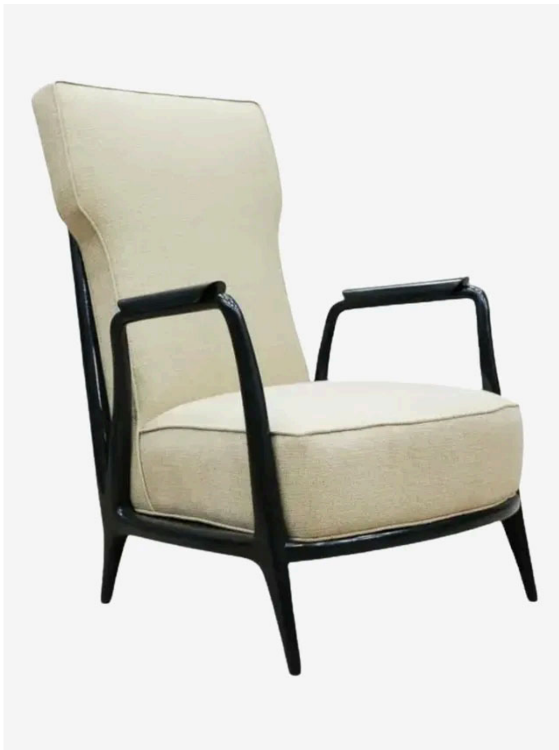
Vintage Mid-Century Modern Armchair