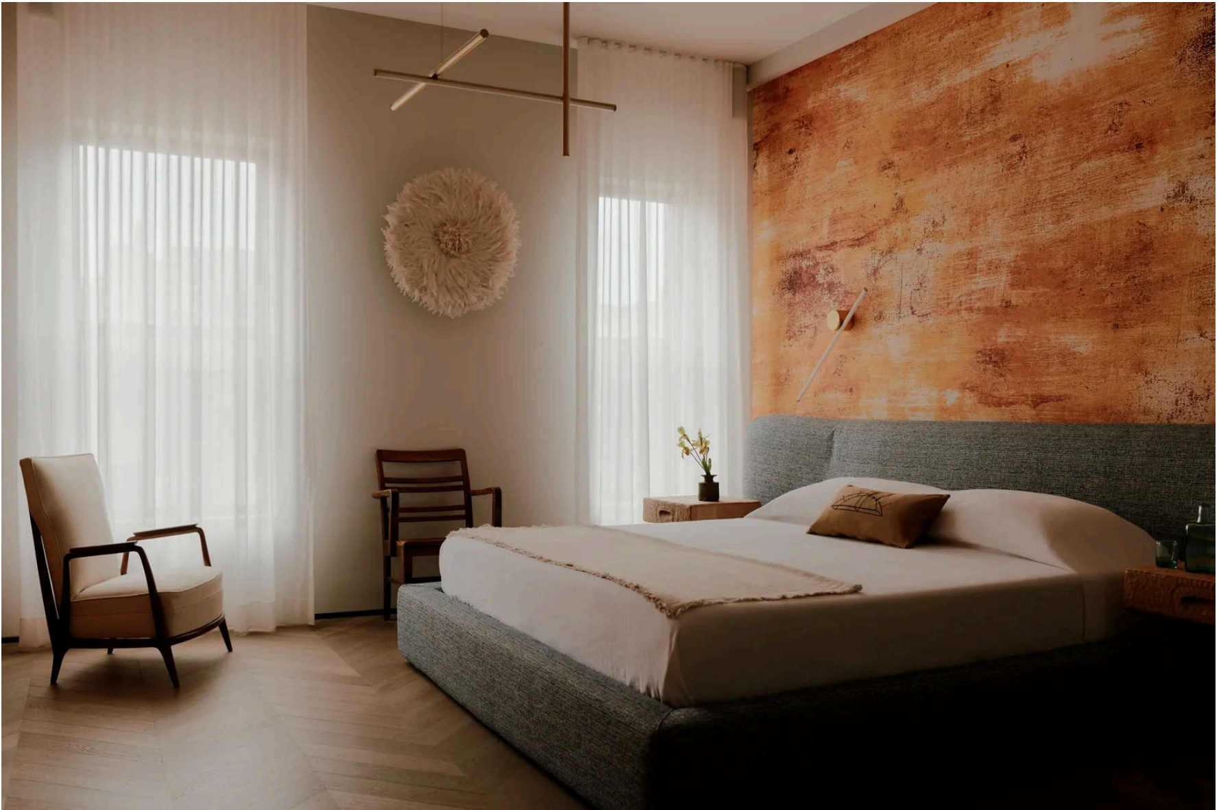
A custom Affreschi & Affreschi wallcovering adds color and texture to the primary bedroom, where the bespoke bed wears Parachute linens . Vintage Giuseppe Scapinelli armchair .

Menino Design Studio specified Tiger Onyx for the home's statement-making custom bar and matching wall cladding behind it.