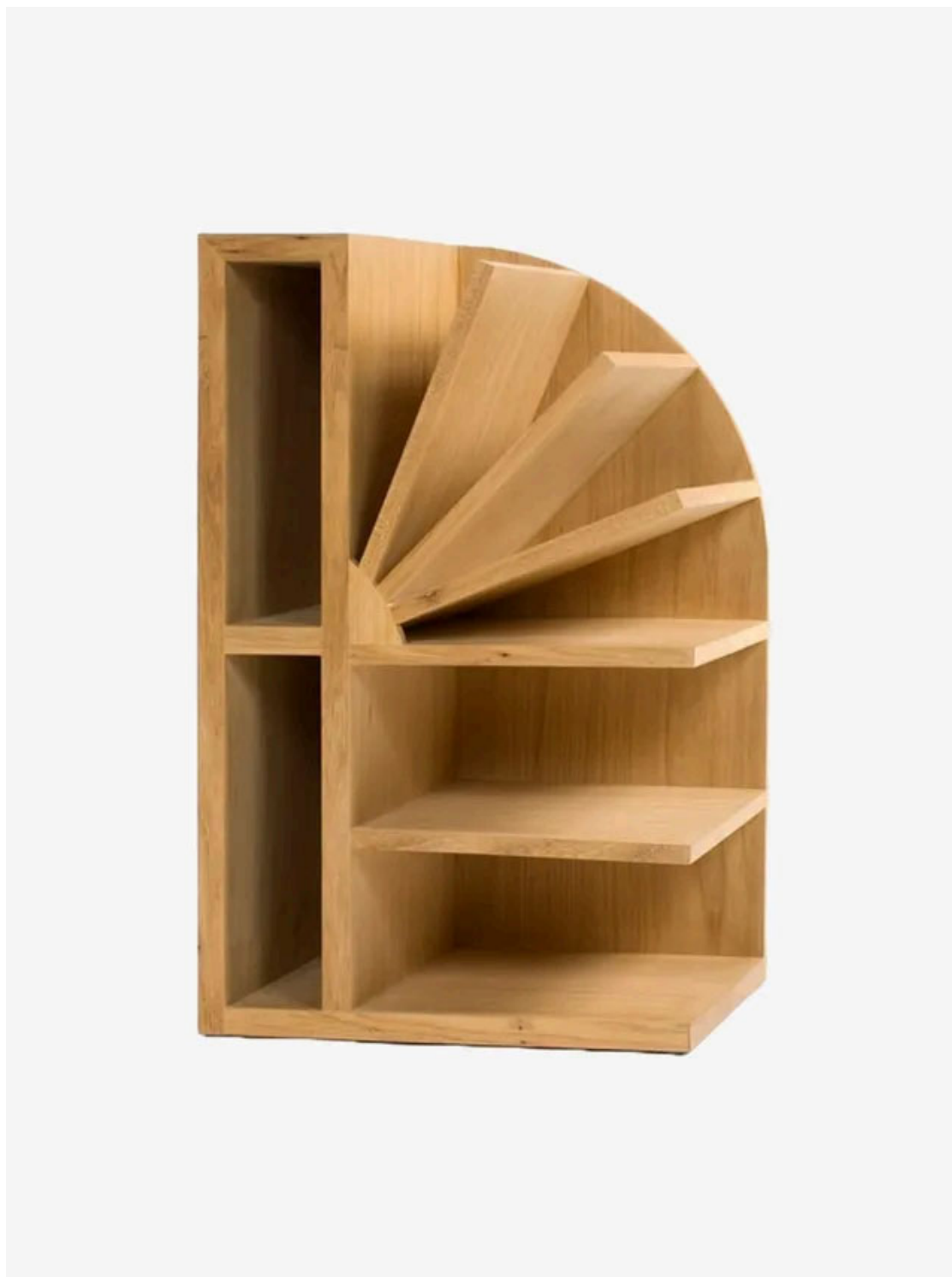
ETEL Leque Magazine Holder