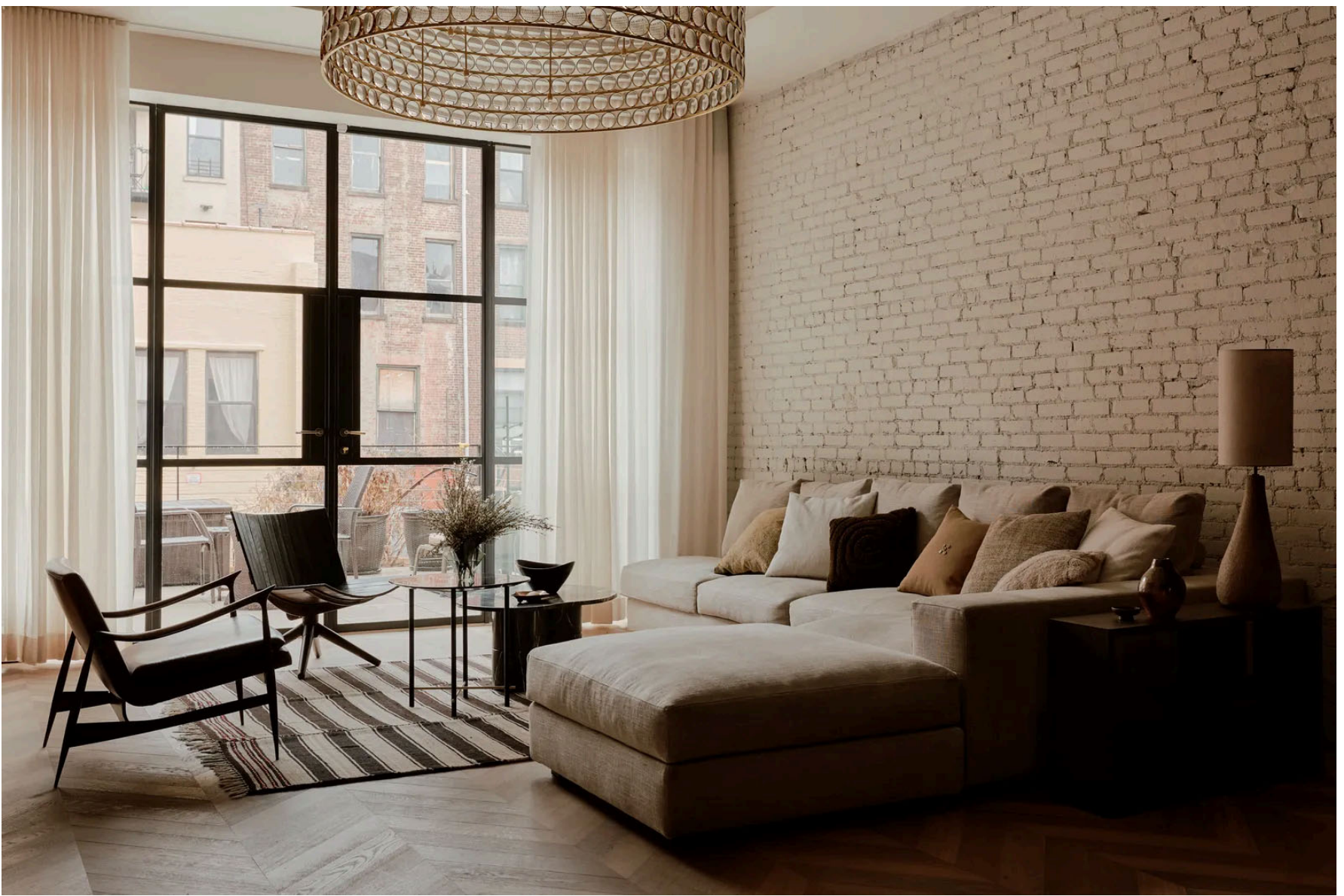
A vintage kilim rug is underfoot in the serene living room where the custom Italian-made sofa gathers with a custom marble cocktail table and vintage chairs by Jorge Zalsupin and Carlos Motta in front of new bespoke steel-framed doors to the terraced garden.