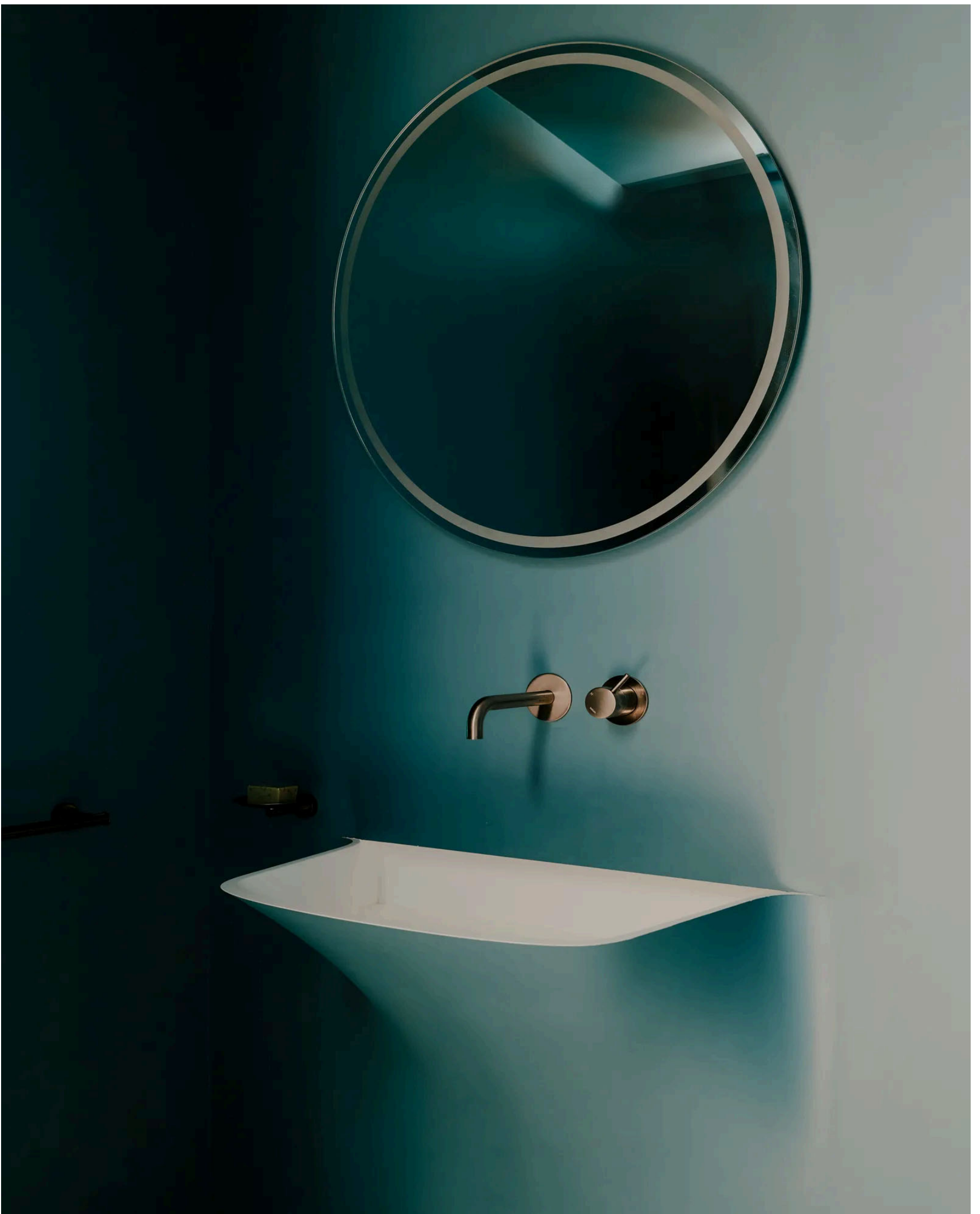
Farrow & Ball's Sloe Blue paint colors the powder room with a mirror and sink by Antonio Lupi with Hotbath fixtures.