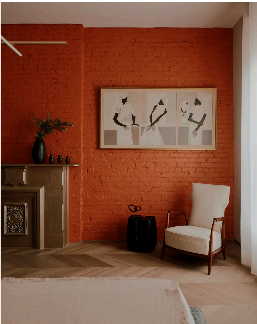
A painting by Ernest Crichtlow hangs on a Benjamin Moore orange -painted brick wall in the primary bedroom, which features an existing fireplace mantel with vases by Marion Naufal . Sculpture (on side table) by Victoire d'Harcourt . Vintage Giuseppe Scapinelli armchair .