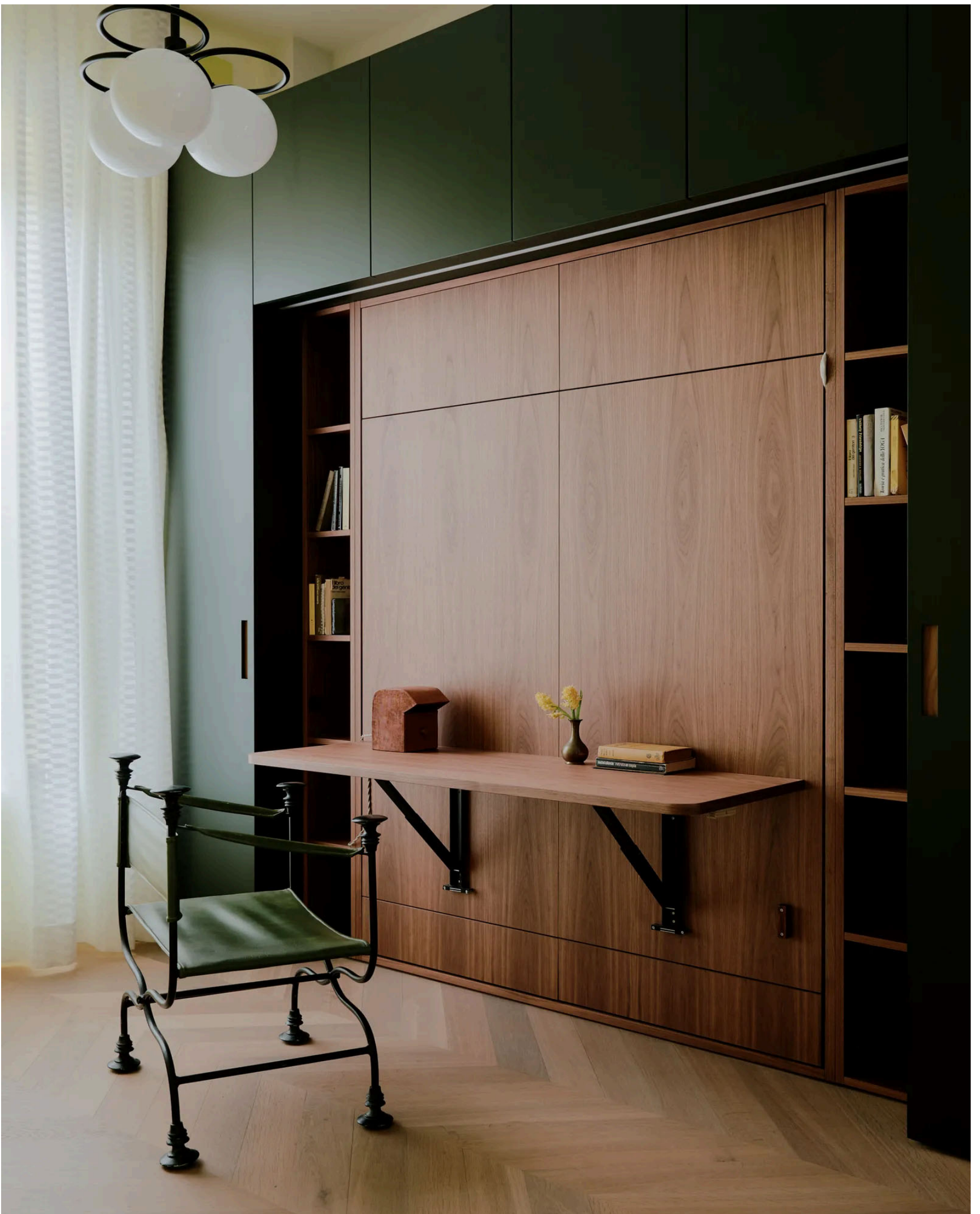
The library has a custom Italy-made Murphy bed to transform it into a guest bedroom. The chandelier is by Ferm Living and the chair is vintage.