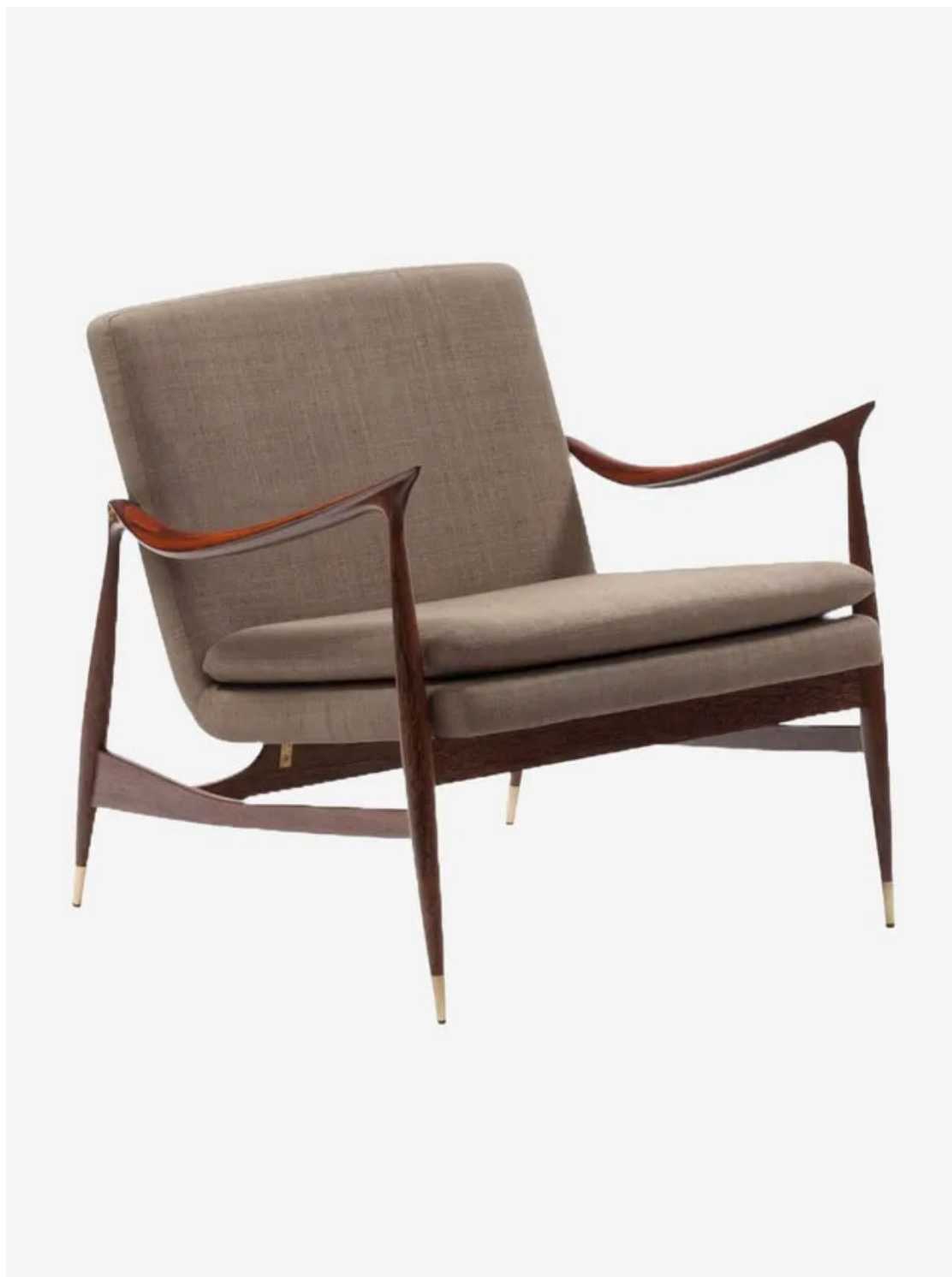
ETEL Dinamarquesa Armchair