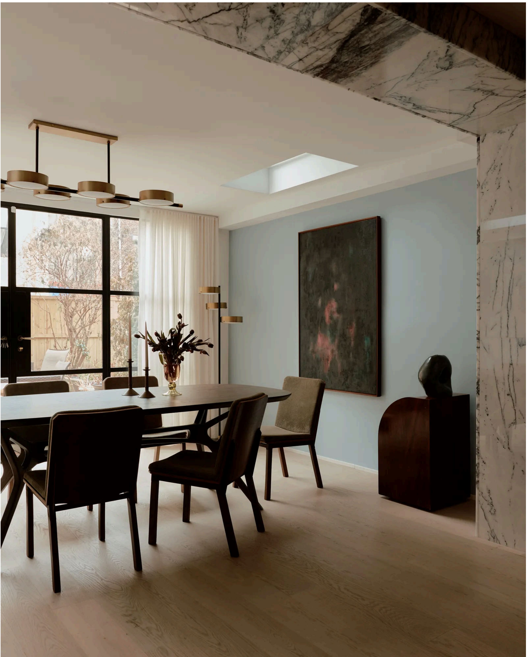
A Lilac marble-wrapped portal visually connects the kitchen and new dining room extension, both painted in Farrow & Ball's Borrowed Light . In the latter, the custom ash table is surrounded by side chairs by Carlos Motta from New York gallery Espasso . Lighting by Jonathan Adler ; art by Norman Lewis.

With heritage in mind, Italian-born Menino drew up an interior scheme that integrates craftsmanship from their shared homeland into every room of the 3,800-square-foot brownstone, while maintaining its historical details. Marble sourced directly from Italy builds bespoke furnishings throughout the house. The living room's Tiger Onyx bar is framed by a matching backlit wall. The designer selected a lilac-veined stone for the kitchen's countertops, backsplash, and dramatic portal that connects it to the dining room, a new extension with direct access to garden and uninterrupted views through large, windowed doors. The baths feature statement examples like the bespoke Azul Cielo sink, which extends from the wall to give a floating effect in the skylit primary, or the Musk green polished marble tiles that clad a guest shower.