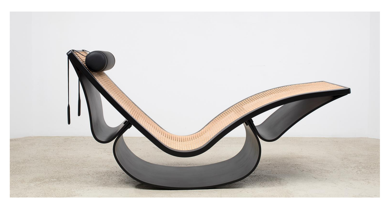
Rio Chaise lounge by Oscar Niemeyer, 1978

Espasso will show the collection at Corso Garibaldi 117 from 9 − 14 April. UK-based Tala lighting will also be on hand to illuminate the installation. ★