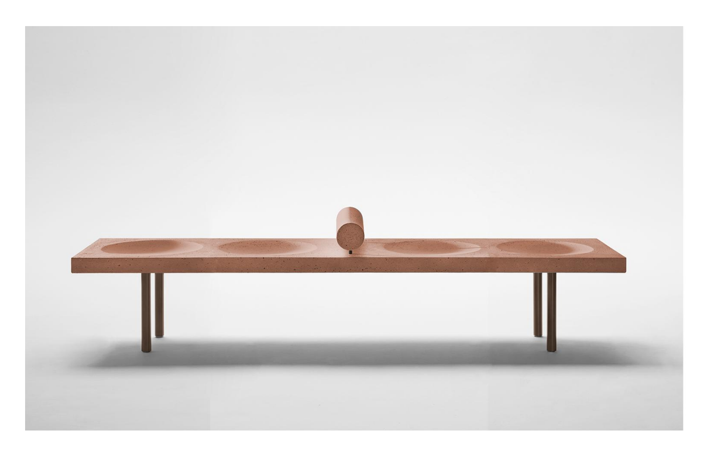
Domino Concreto Bench by Claudia Moreira Salles for Espasso

f \quad \mathbf{y} \quad \mathbf{p} \quad \text{in} \quad \boldsymbol{\Rightarrow}