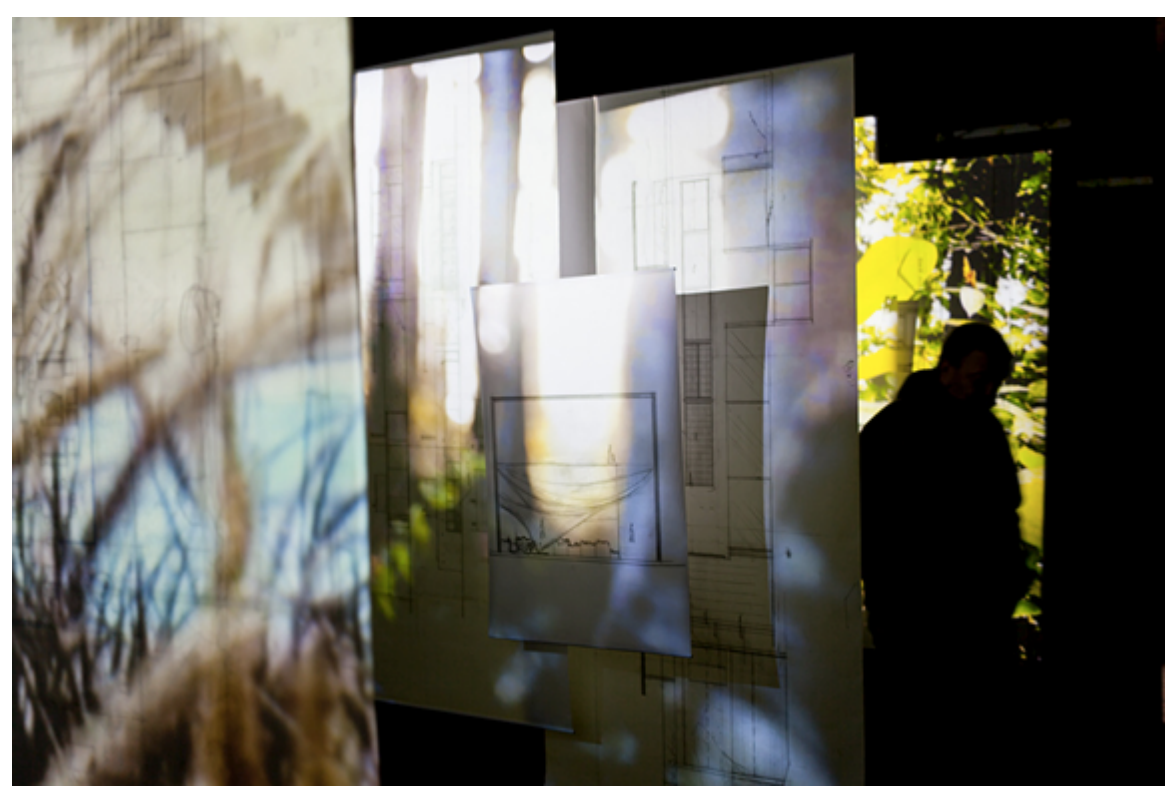
the exhibit features a site-specific art installation