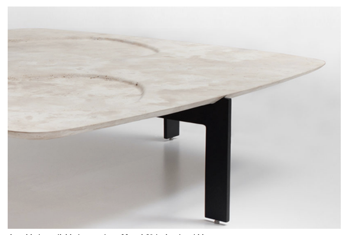
the table is available in two sizes, 33 and 50 inches in width

the 'square coffee table' is comprised of travertine and blacked steel