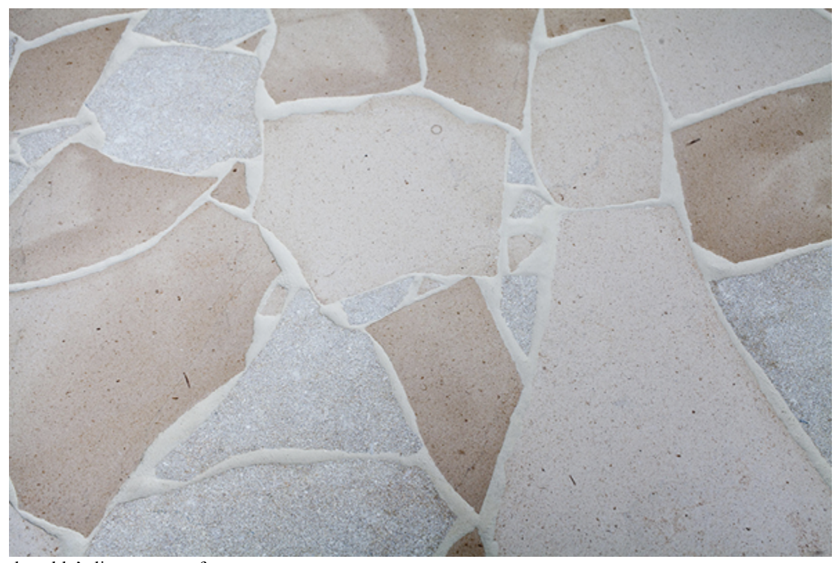
the table's limestone surface

the exhibition coincides with the release of 'studio arthur casas: works 2008-2015' — a new monograph surveying the recent projects of arthur casas. the book highlights major designs dating from the last seven years through explanatory texts, color photos and rarely-seen drawings.