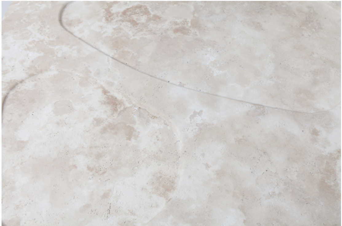
detail of the travertine surface