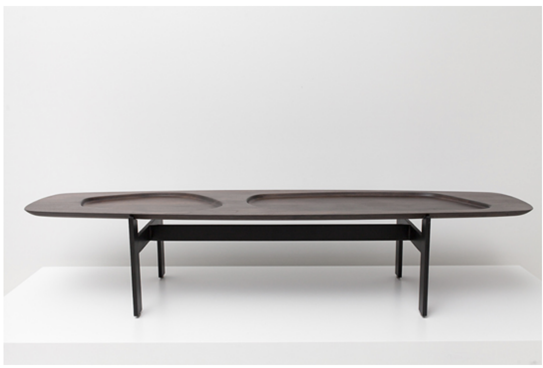
the 'rectangular coffee table' is available in two different widths