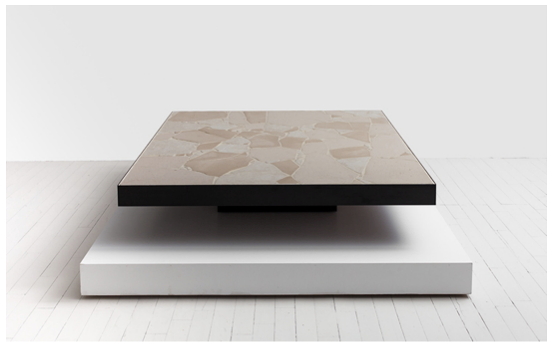
the coffee table sits on a blackened steel base

the collection comprises five distinct pieces, handcrafted by brooklyn-based fabricators anchor & canvas: the 'fibonacci bookcase' and 'rectangular coffee table' both made from stained american walnut and blacked steel; 'square coffee table' comprised of travertine and blacked steel; 'copacabana sideboard' handcrafted from american walnut; and the 'tiles coffee table' made of limestone and blackened steel. these new pieces are joined by previously released works, such as the 'AC dining table', 'zumbi chaise', 'quilombo desk', and the 'ondas sideboard'.