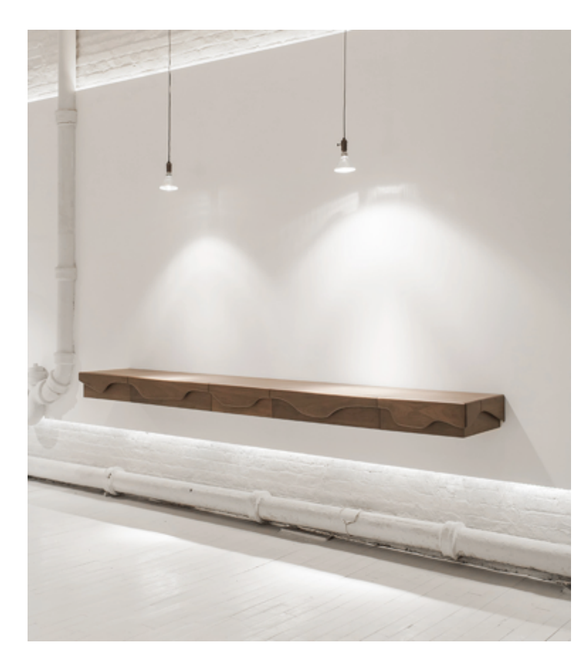
the walnut 'copacabana sideboard' comes in five different sizes