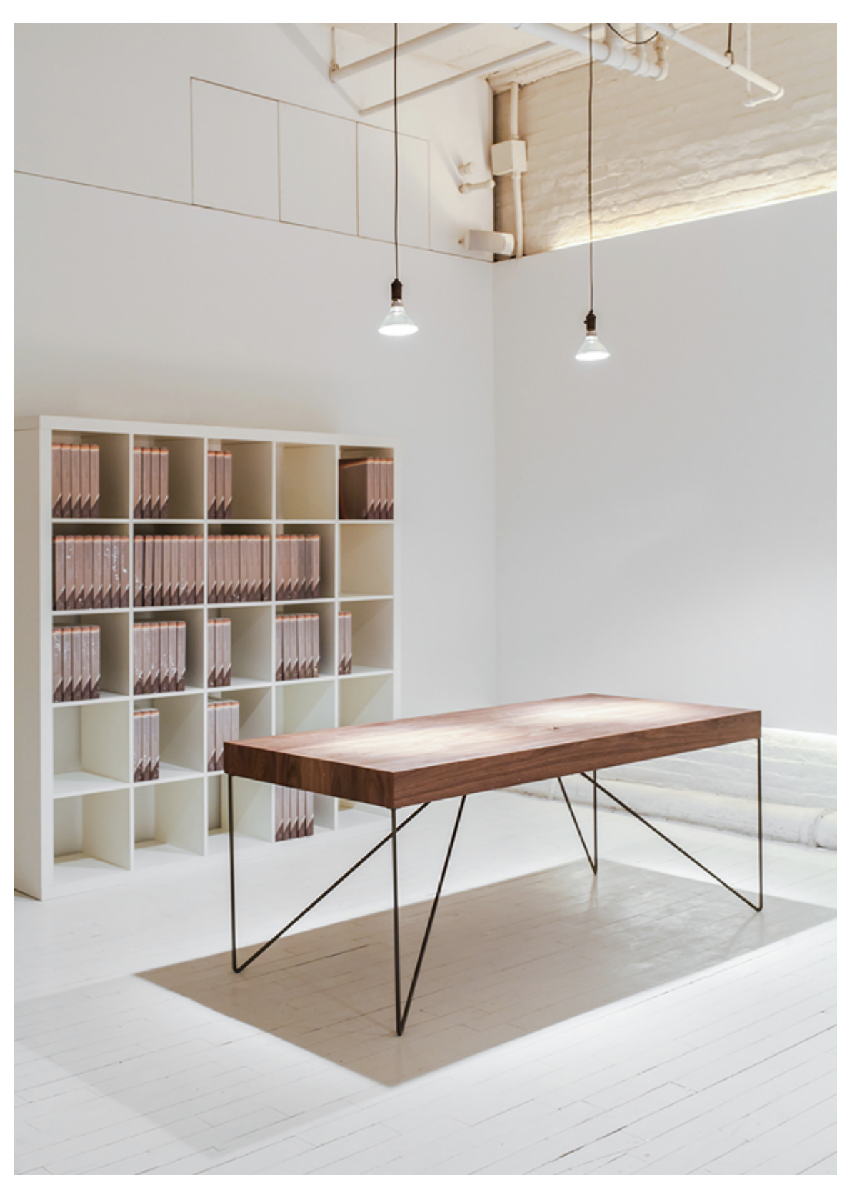
new pieces are joined by previously released works, such as the 'quilombo desk'