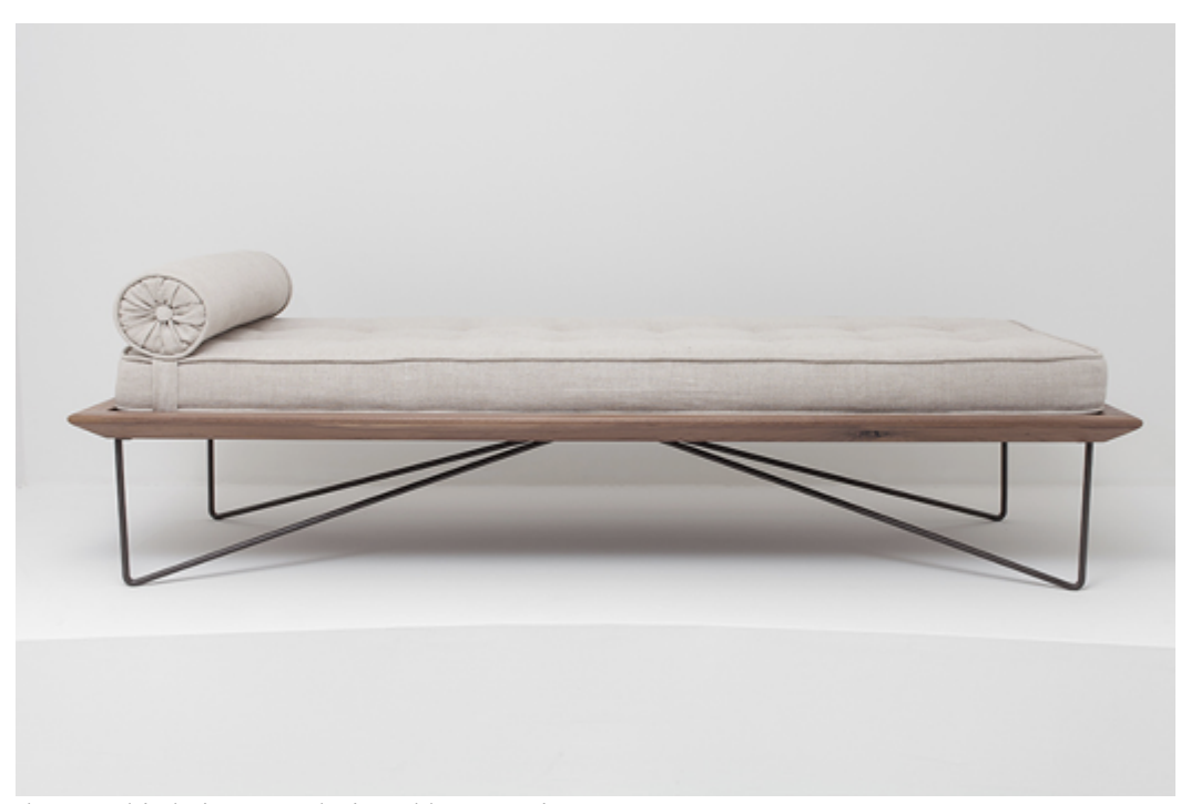
the 'zumbi chaise' was designed by casas in 2006