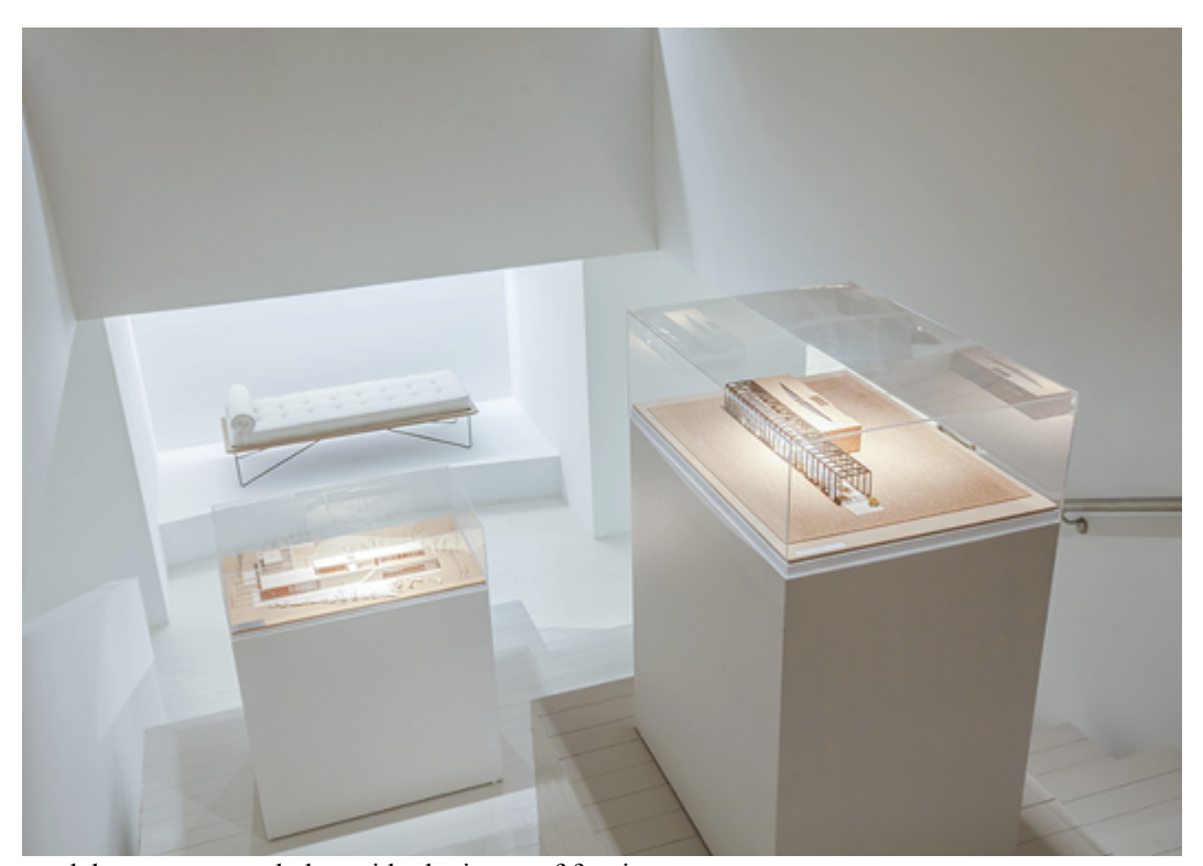
models are presented alongside the items of furniture