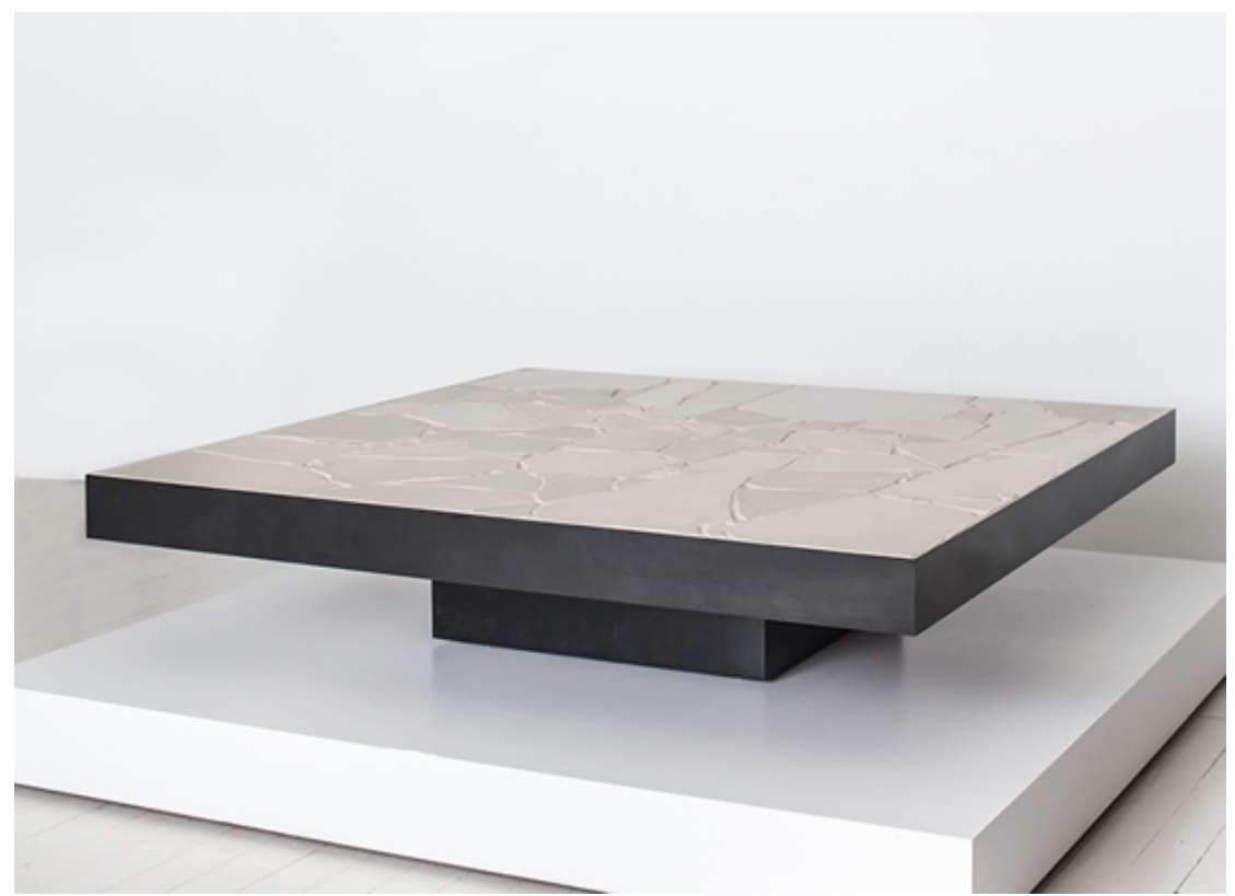
the surface measures 55 x 55 inches (140 x 140 cm)

the exhibit also features a site-specific art installation that transforms the first floor of the gallery and immerses visitors as they enter the main presentation area. this spatial environment, designed by casas himself, features a great number of the architect's works displayed on vellum screens. photographs, drawings, and sketches are complemented with an audio soundtrack and a fragrance designed to evoke a rainforest atmosphere.