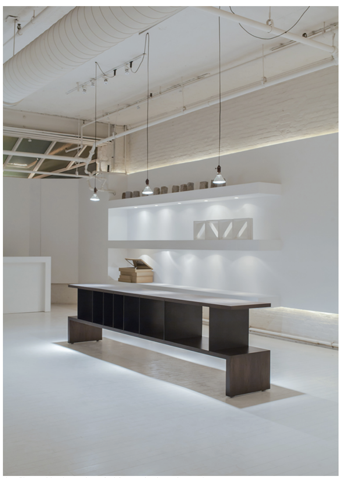
the 'fibonacci bookcase' is crafted from stained american walnut