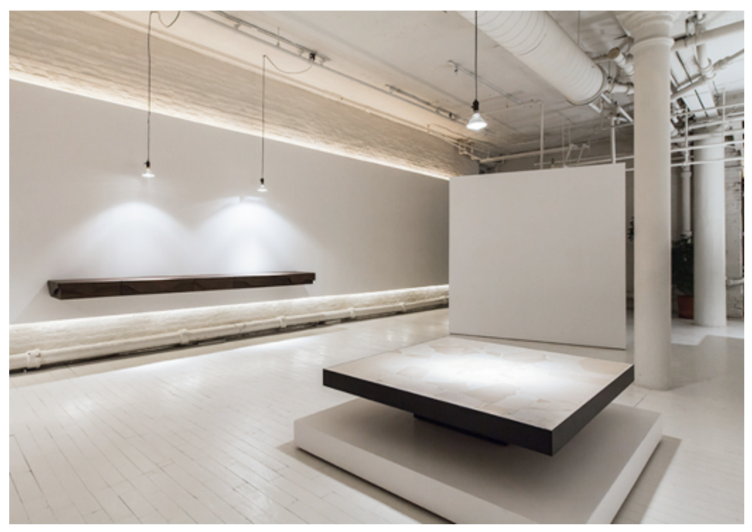
'made in america' premieres five new works that have been entirely handcrafted in brooklyn

the collection comprises five distinct pieces, handcrafted by brooklyn-based fabricators anchor & canvas: the 'fibonacci bookcase' and 'rectangular coffee table' both made from stained american walnut and blacked steel; 'square coffee table' comprised of travertine and blacked steel; 'copacabana sideboard' handcrafted from american walnut; and the 'tiles coffee table' made of limestone and blackened steel. these new pieces are joined by previously released works, such as the 'AC dining table', 'zumbi chaise', 'quilombo desk', and the 'ondas sideboard'.