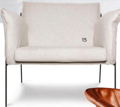
15_SOFT LANDING The minimal steel frame of Skeehan's 'Setto' chair cradles an enveloping cushion that wraps over the edges to offer ultimate comfort. catapultdesign.net.au

The sophisticated construction of the 'Cortina' chair (below) by Minotti appears to defy gravity. dedece.com