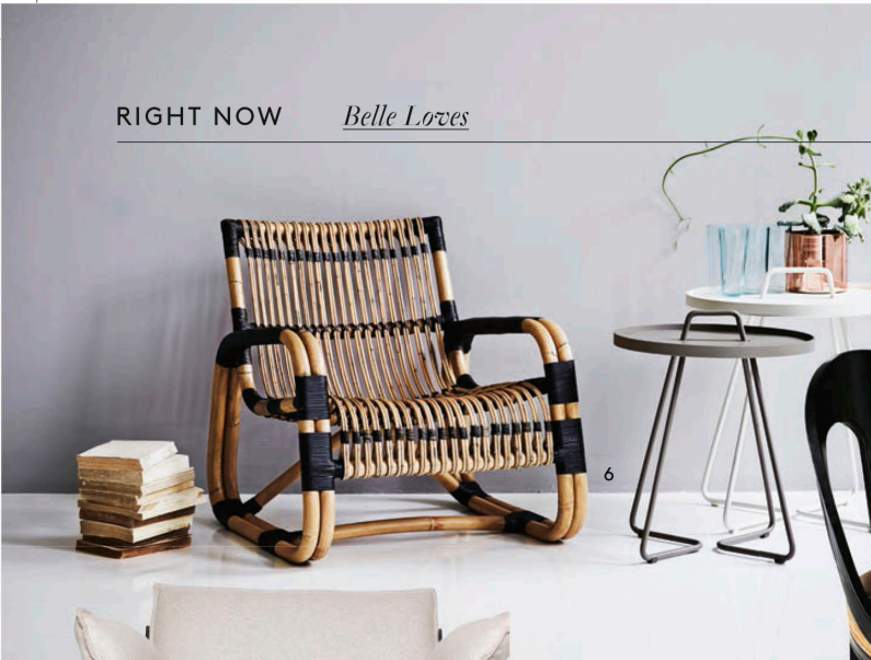
6_CANE AND ABLE Consisting of traditionally shaped and bound natural rattan, 'Curve' by Cane-Line is a lightweight chair ideal for relaxed living. spenceandlyda.com.au